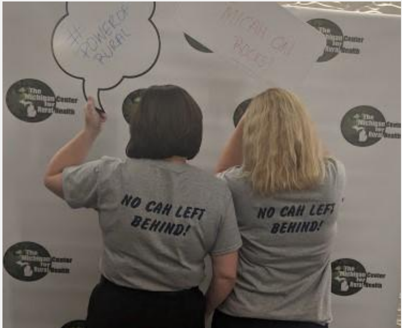
A fun showcase of the commitment of the MICAH QN. Member T-Shirts showcasing their motto "No CAH Left Behind".

The Federal Office of Rural Health Policy, Health Resources and Services Administration (HRSA), is recognizing ten states for outstanding quality performance of their Critical Access Hospitals (CAHs) in achieving the highest reporting rates and levels of performance over the past year. MI is one of those Top 10 States!